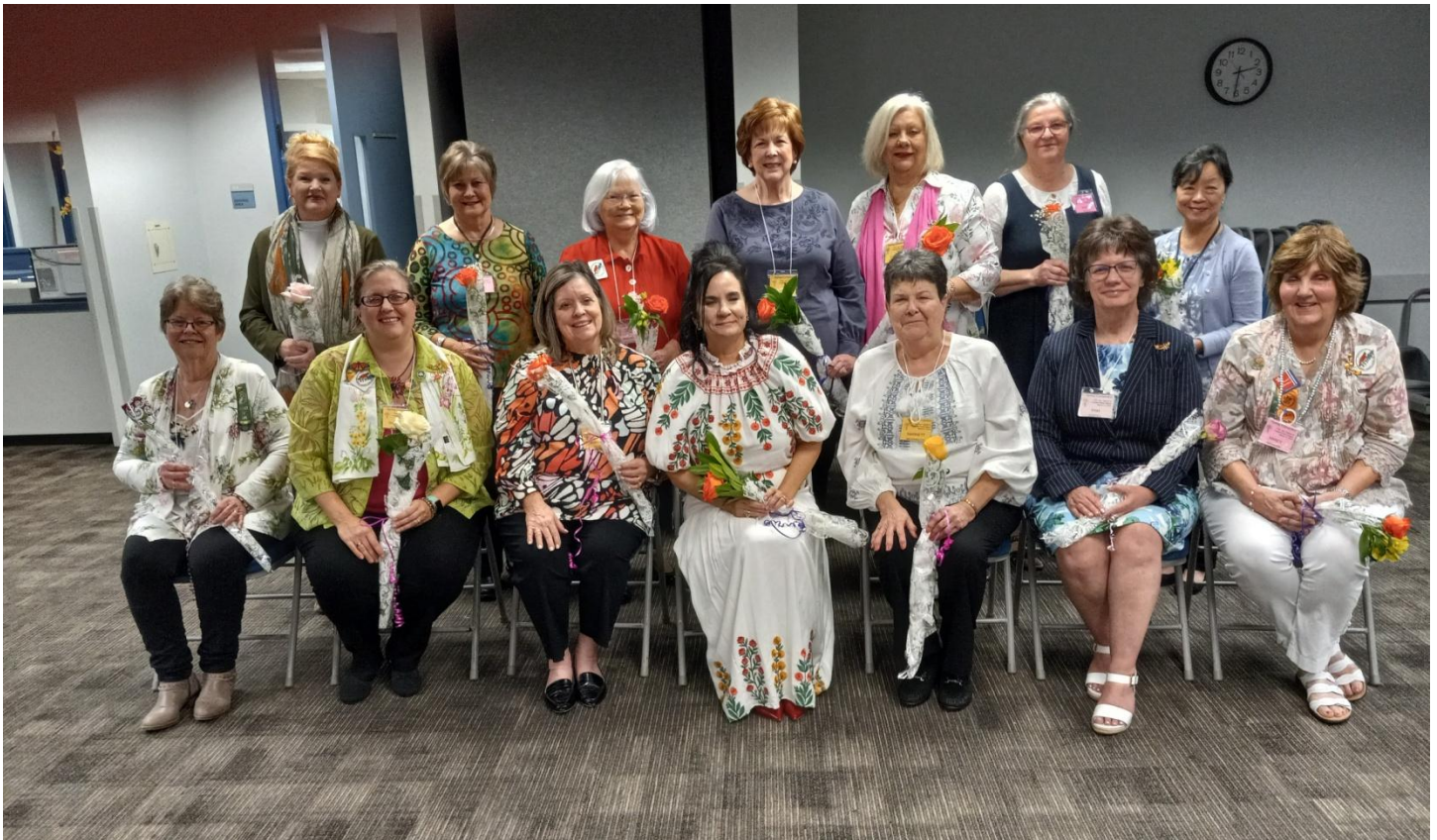
Dist. IV Officers 2023-25

Each CGC member attending agreed the event was a lot of fun. Please consider going next year!