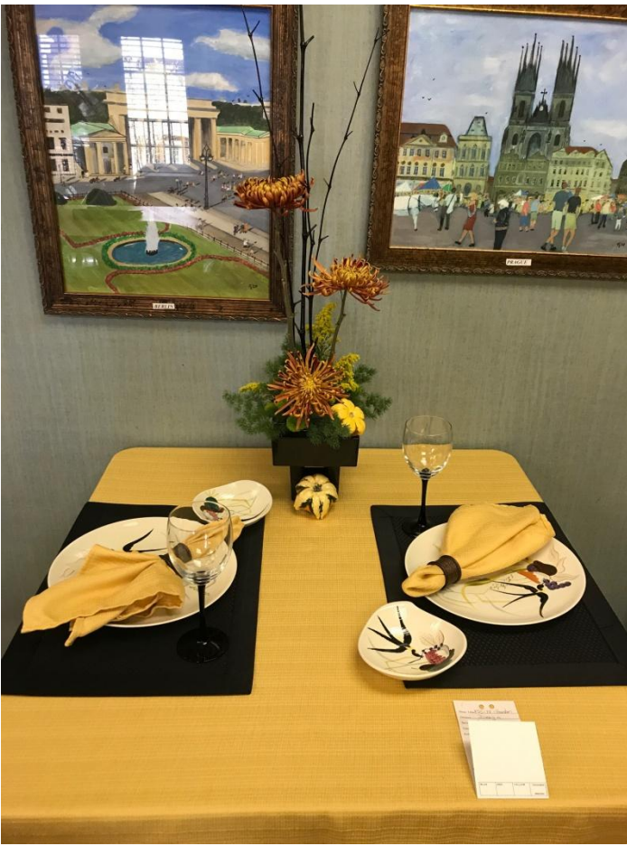
Example of Functional Table