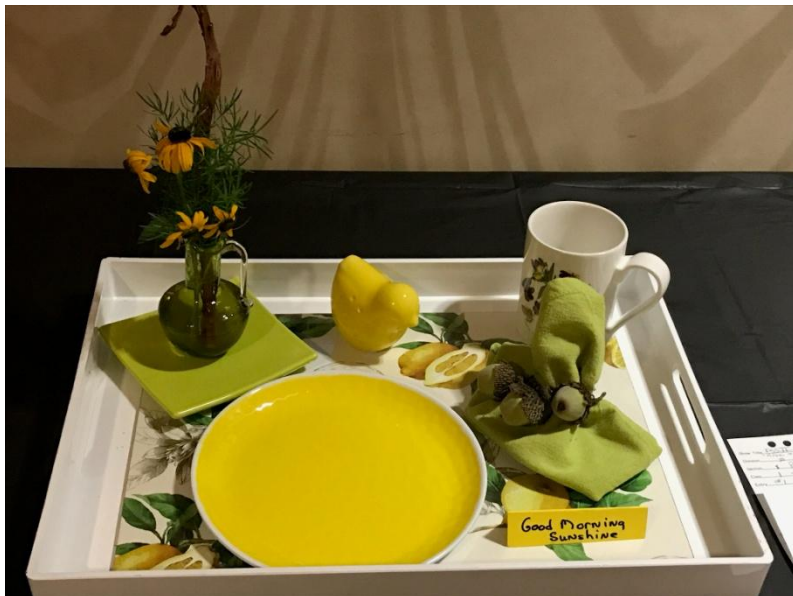
Example of Tray