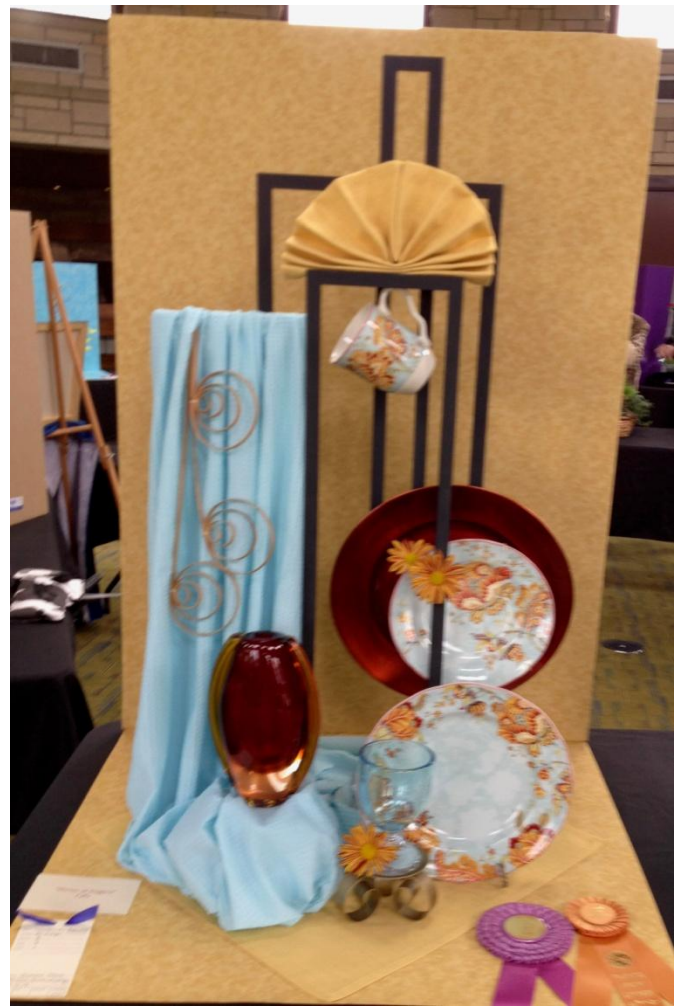
Example of Exhibition Table