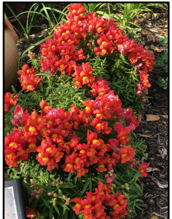
Snapdragons (on right)