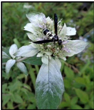
Black wasp pollinating flower

Impact of Mosquito and Nuisance Insects Sprays on Pollinators: “Fogging or spraying for mosquitos and biting flies around the yard with insecticides are very harmful to pollinators. A combination of factors is causing declines in bee and pollinator populations . . . loss of habitat . . . and pesticide exposure.” These sprays do the same damage to all of our desirable pollinators – they die.