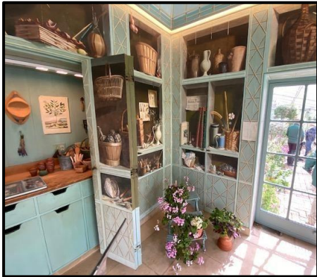
Members enjoyed the greenhouse and its famous trompe-l'oeil painted atrium.

Oak Spring Garden Foundation horticulture experts answered questions about plants, and even shared details about the heated sidewalk created to see guests safely from the guesthouses to the main house in inclement weather.