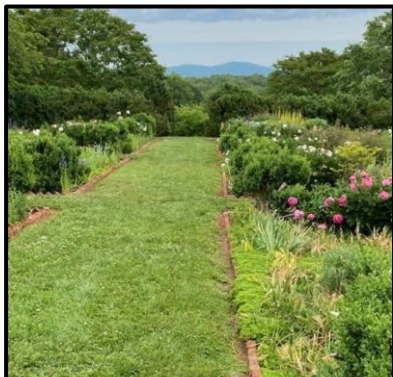
Surrounded by the Blue Ridge Mountains, the formal garden was filled with peonies, baptisia, irises, wild geraniums, roses, larkspur, amsonia and more.