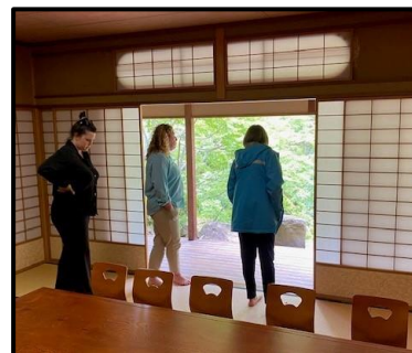
A look inside the tea house in the Japanese garden.